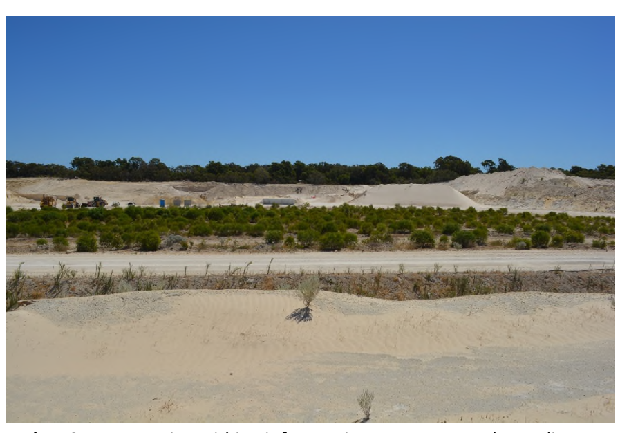
Plate 2 : Revegetation within pit for previous state approval compliance.