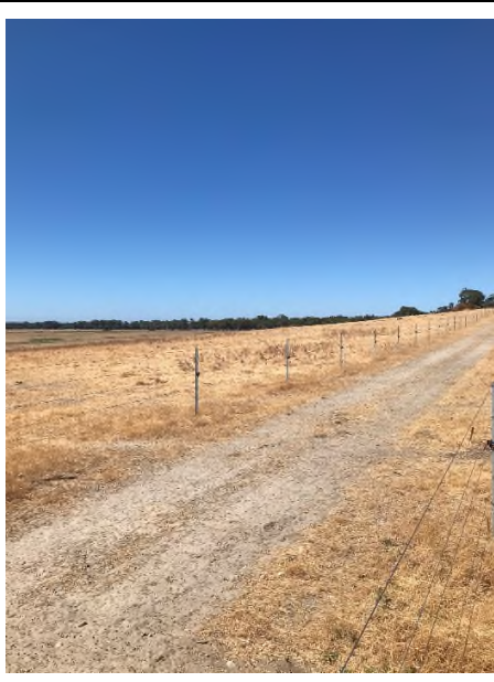
Plate 4: Offset Area (area east of fence), February 2024, looking south.