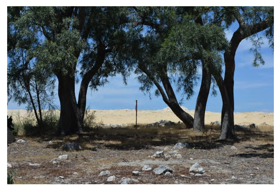
Plate 3 : Peg marking the project area along the western boundary.