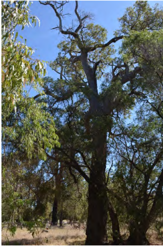
Plates 3 and 4: Upper storey vegetation within the 'revegetation' area