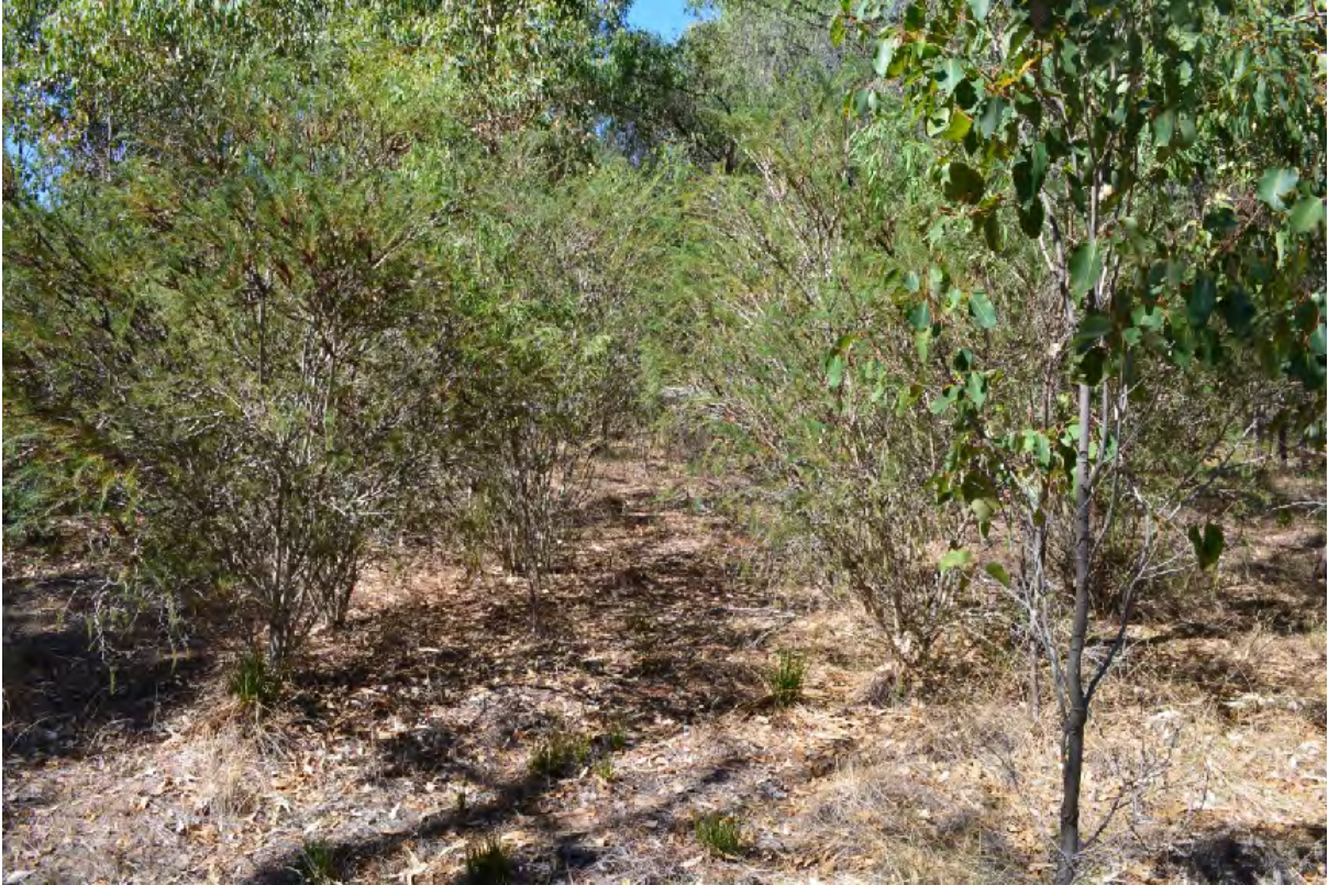
Plates 1 and 2: Midstorey vegetation within the 'revegetation' area