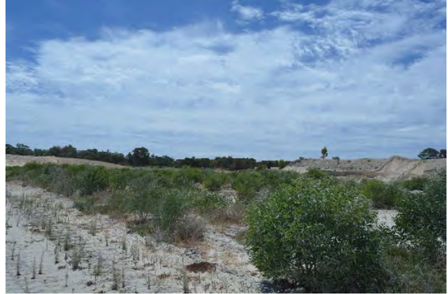
Plate 2: Revegetation within pit for previous state approval compliance.