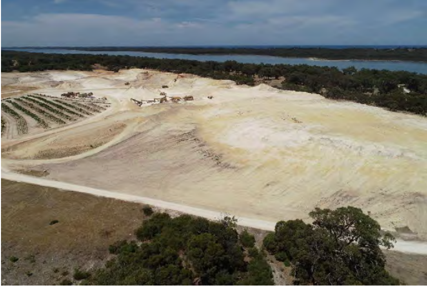
Plate 1: Aerial overview of the project looking west towards Lake Preston.