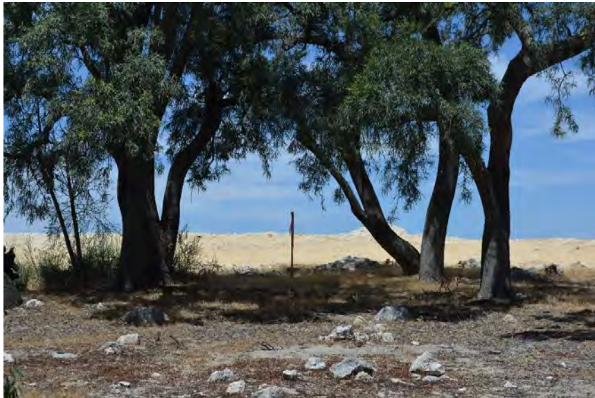
Plate 3: Peg marking the project area along the western boundary.