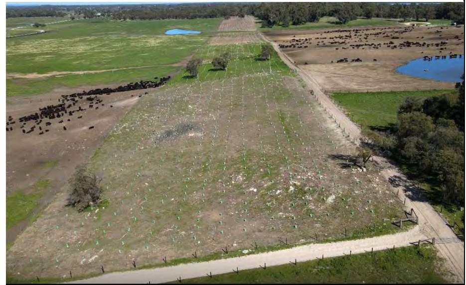
Plate 4: Revegetation of the Offset Area in winter 2021, looking south.