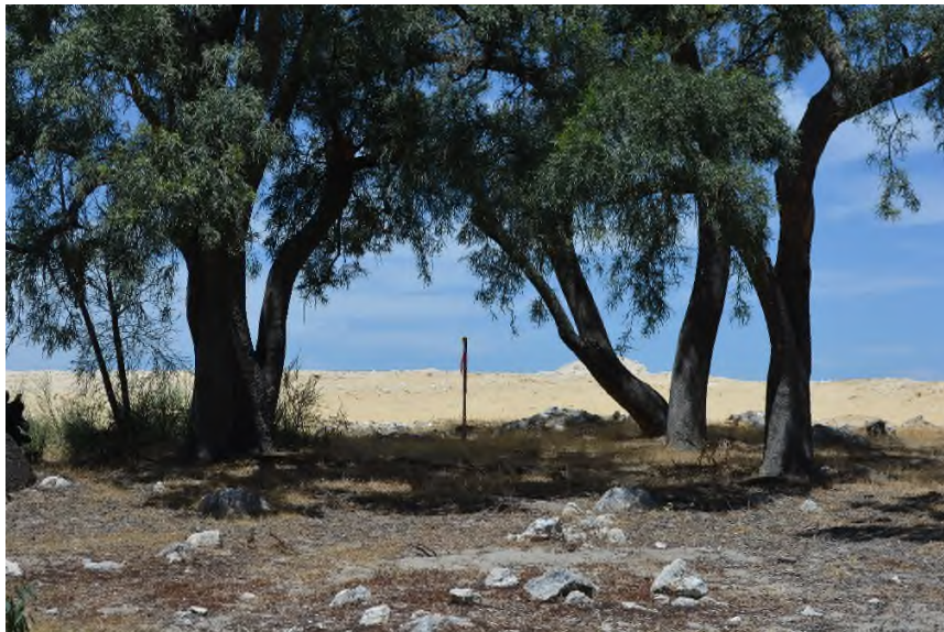
Plate 3: Peg marking the project area along the western boundary.