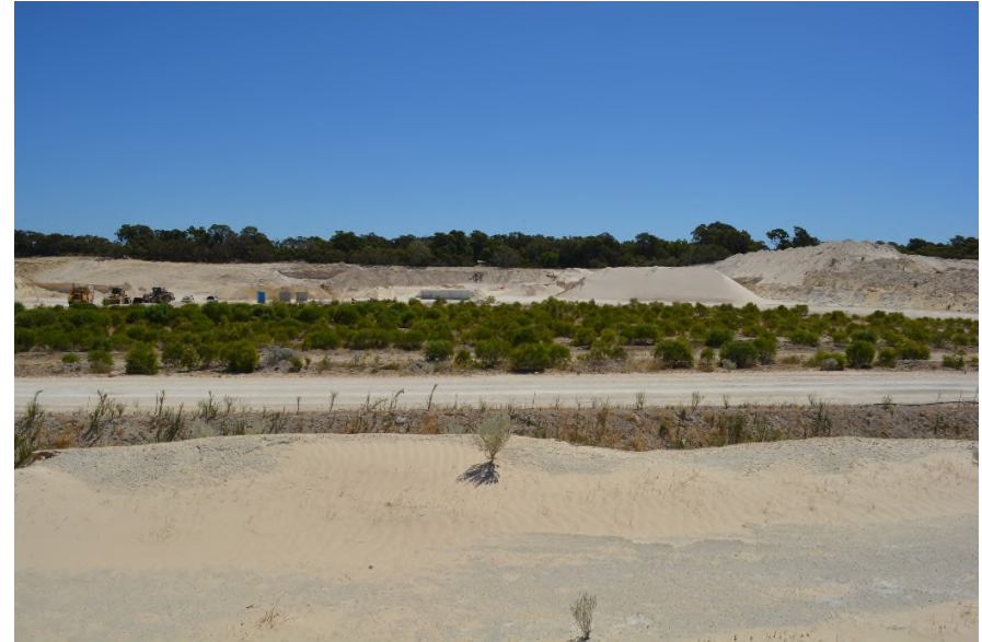
Plate 2: Revegetation within pit for previous state approval compliance.