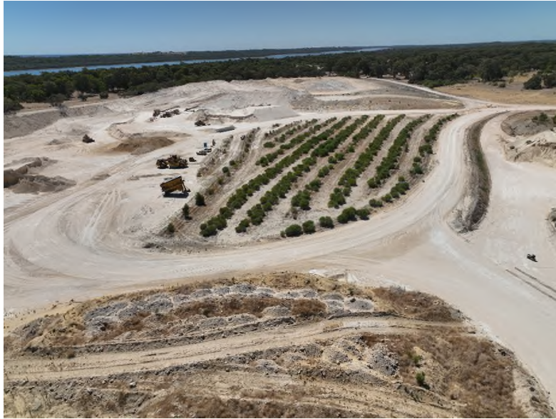
Plate 1: Aerial overview of project looking northwest towards Lake Preston.