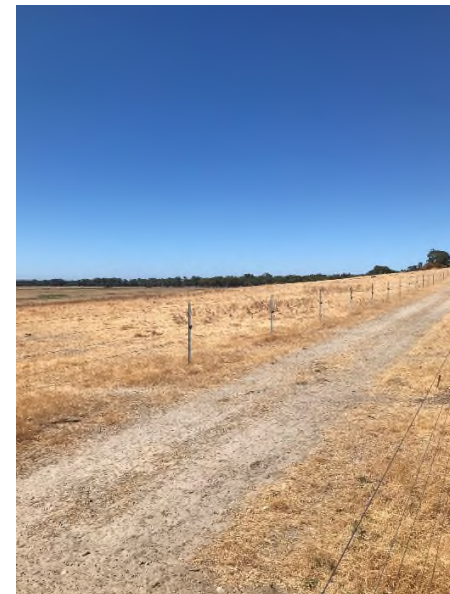
Plate 4: Offset Area (area east of fence), February 2024, looking south.